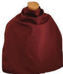
Dignity Clothing Protector