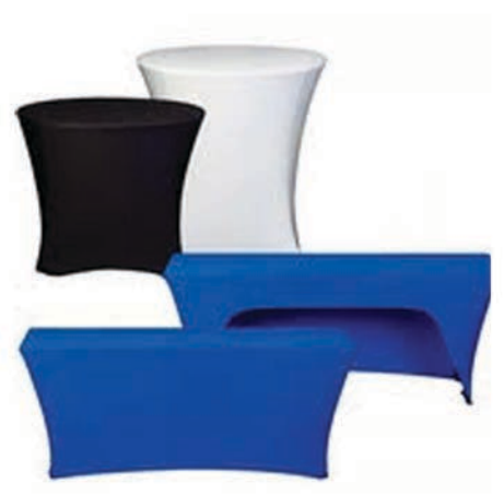
Form Fit Covers