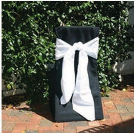
Decorative Chair Covers