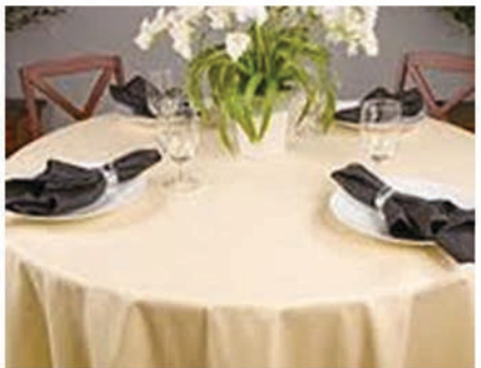
Table Cloths & Skirting