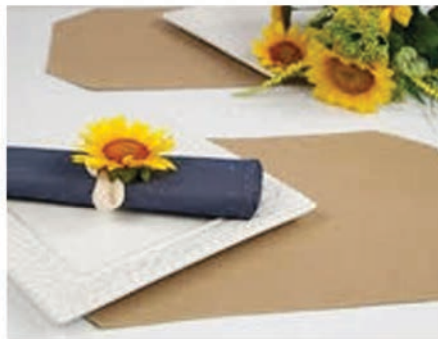
Woven Vinyl Placemats